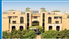
HOMOEOPATHIC MEDICAL COLLEGE